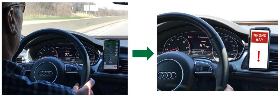
Figure 2: Concept - Wrong-Way Alert from Mobile App