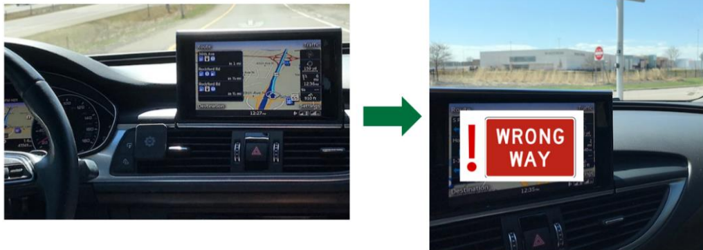
Figure 1: Concept - Wrong-Way Alert from In-Vehicle Navigation

These interventions could reach many more drivers than on-road countermeasures alone, by providing alerts at all times and all locations while the application is being used.