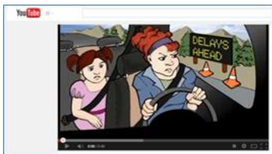
Screenshot of YouTube Video Demonstrating Late Merge

There are several strategies to improve public compliance with the dynamic merge techniques. An example of this type of public education outreach was done by Colorado DOT in 2013 for two projects using dynamic late merge. Colorado DOT utilized news outlets and created a YouTube Video Demonstrating Late Merge 4 to educate drivers about how to understand the signage and use dynamic late merge appropriately.