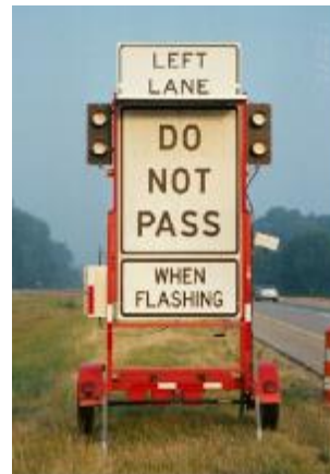
Dynamic Sign and Trailer Used in Michigan 20

optimal system layout and settings, inappropriate spacing between dynamic signs, the sign messages being new and unfamiliar, and the installation of the system when not warranted that can all lead to non-compliance.