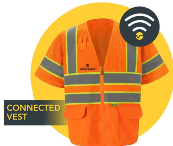
Figure A-1 Worker Presence Connected Vest

Deployment and Operation: The Worker Presence Connected Vest, shown in Figure A-1, has only recently become commercially available through a vendor. Previously, it was developed and tested in Virginia by the Virginia Tech Transportation Institute (VTTI). In that demonstration, it was deployed in conjunction with smart cones used to define a “safe area” for the work zone activities and a base station that would collect and process location data from the vest and cones, which was then used for broadcasting alerts to worker vests, when warranted, and information via both cellular communications to agency systems and also vehicle to everything (V2X) communications to passing connected vehicles.