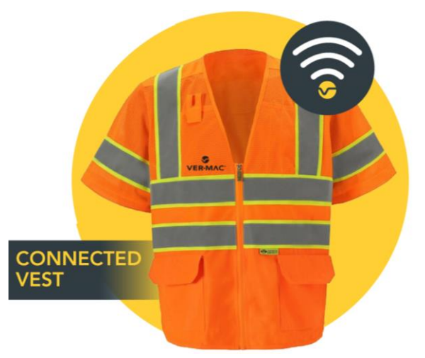
Figure A-1 Worker Presence Connected Vest

Deployment and Operation: The Worker Presence Connected Vest, shown in Figure A-1, has only recently become commercially available through a vendor. Previously, it was developed and tested in Virginia by the Virginia Tech Transportation Institute (VTTI). In that demonstration, it was deployed in conjunction with smart cones used to define a "safe area" for the work zone activities and a base station that would collect and process location data from the vest and cones, which was then used for broadcasting alerts to worker vests, when warranted, and information via both cellular communications to agency systems and also vehicle to everything (V2X) communications to passing connected vehicles.