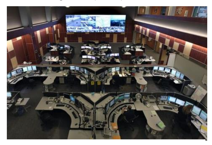
Figure 2: Southeast Michigan DOT

MDOT deployed a hybrid model for their four traffic operations centers (TOCs). For some TOCs it made sense to continue in-person operations, but for other TOCs remote operations were necessary. MDOT transitioned their TOCs separately to ensure someone had control at all times.