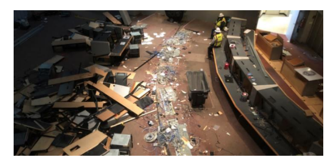
Figure 6: TxDOT San Antonio TMC Demolition April 20, 2020

By the time the COVID pandemic became a threat, the TxDOT San Antonio TMC was two months into remodeling the operations floor and did not feel there was an option to transition to remote operations. See Figure 6. They made the decision to continue onsite operations with added precautions and moved operators throughout the building into a large conference room and offices vacated by other TxDOT employees. See Figure 7. TxDOT had more than 150 people in and out of their building with contractors and sub-contractors. Everyone entering the building was required to go through a temperature check and masks were required at all times. Inside doors remained open and hand sanitizer was widely available for employees to use.