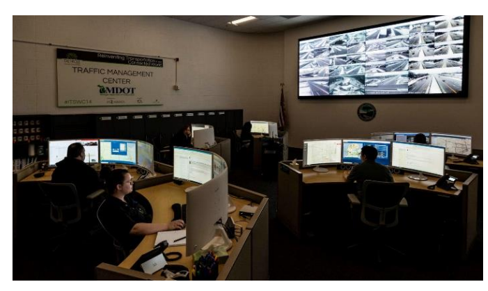
Figure 3: MDOT Statewide STOC

The Statewide TOC (STOC) is co-located in Lansing with MDOT ITS employees. STOC utilizes up to 6 operators with up to 14 support staff and moved to remote operations. See Figure 3.