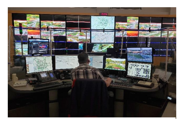
Figure 5: Curtains from PVC pipes around MnDOT RTMC Workstations