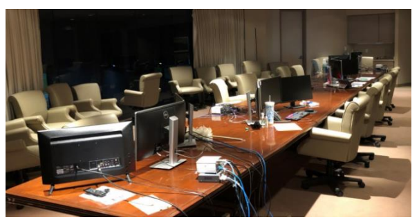
Figure 7: Temporary TxDOT San Antonio TMC Workstations