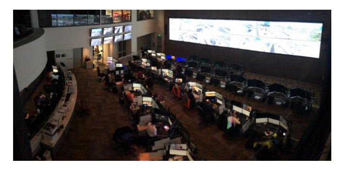
Figure 8: Remodeled San Antonio TMC March 3, 2021