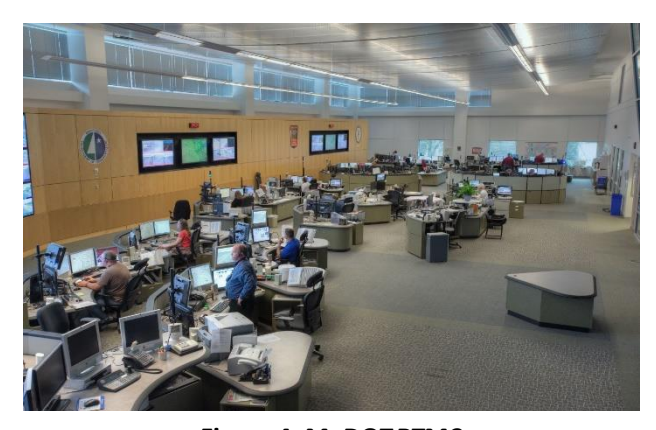
Figure 4: MnDOT RTMC Photo Courtesy of MnDOT