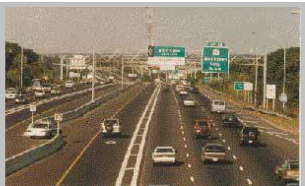
A typical buffer-separated freeway HOV lane, with police observation in use to monitor the lane for violators (Long Island Expressway, New York)

when general purpose lanes typically become congested and unreliable. The functionality of an HOV lane relies on it being used exclusively by the designated type / class of vehicles; if appreciable numbers of ineligible vehicles use it as well, not only will the performance of the lane suffer and affect all users, but the public perception of the value of the lane (by both users and non-users) is likely to suffer and lead to even more misuse. This may eventually lead to near-elimination of the HOV priority function and loss of public support for other HOV lanes and Transportation Demand Management (TDM) initiatives.