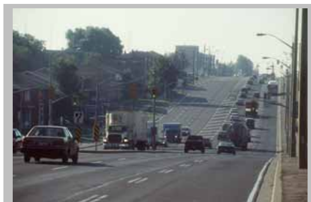
An arterial HOV lane has to allow turning vehicles to use it as well. (Dufferin Street, Toronto)

A well-used highway HOV lane with a committed enforcement program (regular police presence, supplemented by periodic “blitzes”) may have violation rates (proportion of ineligible vehicles in the HOV lane) as low as 1% - 5%. A typical objective for a freeway HOV lane is to maintain violation rates below 10%. At higher levels of violation, public support begins to suffer. If the HOV lane is poorly utilized by eligible vehicles, or if the eligibility rate is set at a more restrictive 3+ rather than the typical 2+, or if the hours of operation or vehicle eligibility rules vary throughout the day, the violation rate tends to creep upwards and to require targeted police enforcement activity.