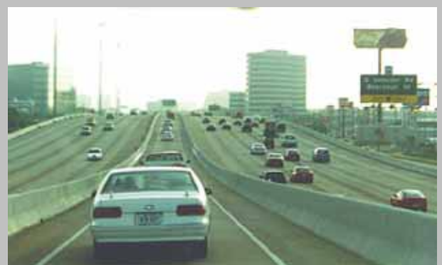
Barrier-separated HOV lanes with limited access/egress (e.g. Houston, TX) can be monitored by visual inspection at a single terminal point.

HOV lanes come in many forms, and are in operation on both arterials and freeways. They are also used in tolled highways and lanes (“HOT Lanes”), whereby eligible HOVs are offered a lower