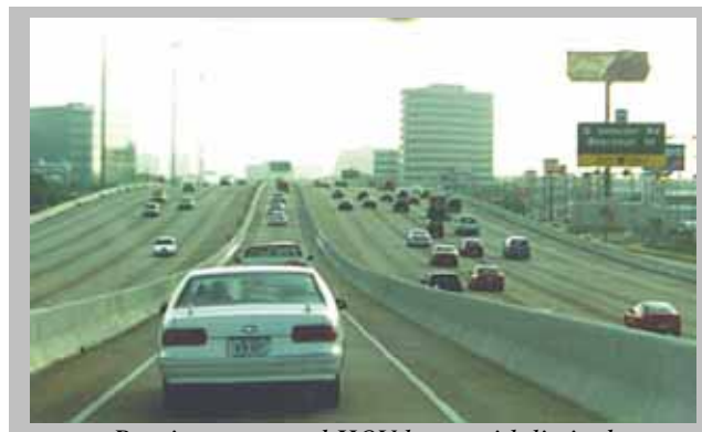
Barrier-separated HOV lanes with limited access/egress (e.g. Houston, TX) can be monitored by visual inspection at a single terminal point.

HOV lanes come in many forms, and are in operation on both arterials and freeways. They are also used in tolled highways and lanes ("HOT Lanes"), whereby eligible HOVs are offered a lower