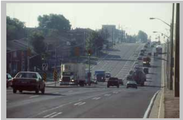
An arterial HOV lane has to allow turning vehicles to use it as well. (Dufferin Street, Toronto)

Arterial roads pose a much more challenging environment for HOV lane compliance. Typical arterial HOV facilities in Toronto<sup>1</sup>, Mississauga, Ottawa<sup>2</sup>,