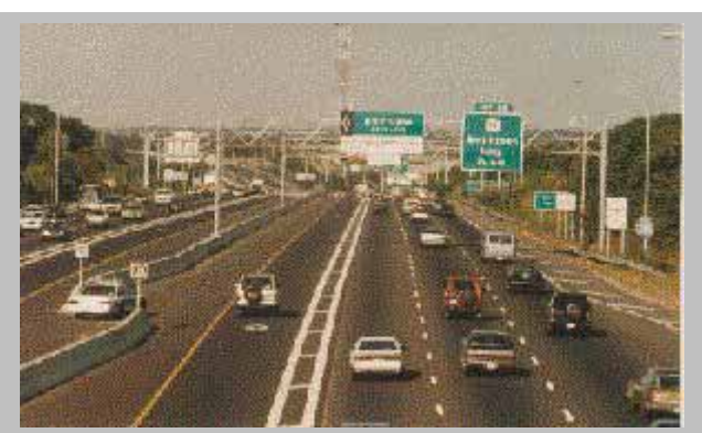
A typical buffer-separated freeway HOV lane, with police observation in use to monitor the lane for violators (Long Island Expressway, New York)

travel periods in urban areas, when general purpose lanes typically become congested and unreliable. The functionality of an HOV lane relies on it being used exclusively by the designated type / class of vehicles; if appreciable numbers of ineligible vehicles use it as well, not only will performance of the lane suffer and affect all users, but the public perception of the value of the lane (by both users and non-